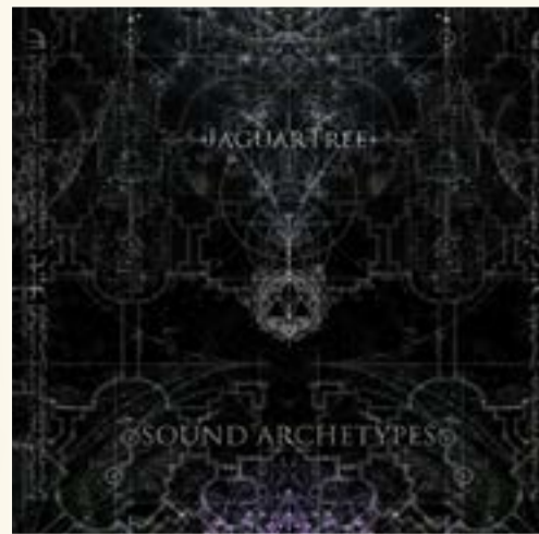
SOUND ARCHETYPES BY JAGUARTREE @MERKABA MUSIC