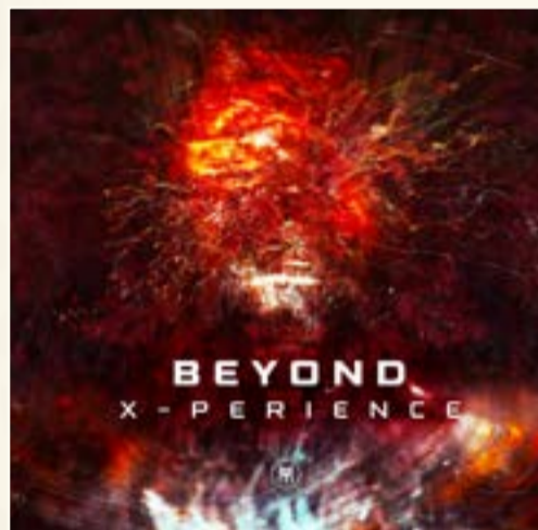
X-PERIENCE BY BEYOND @FUTURE MUSIC RECORDS