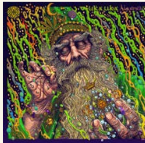
ALQUIMIA BY UKAUKA @SANGOMA RECORDS