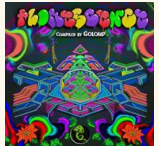
V.A. FLORESCENCE BY GOLOMP @GRIMM RECORDS