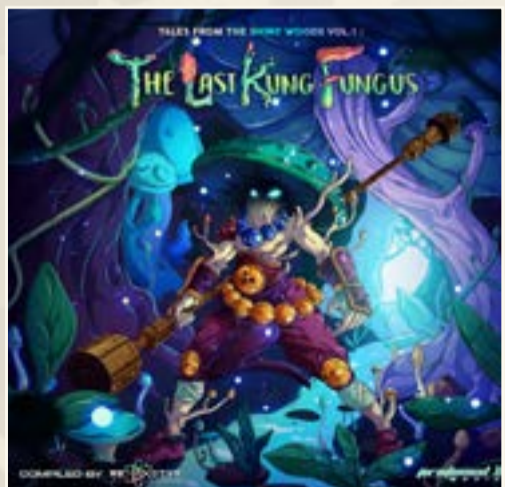
V.A. THE LAST KING FUNGUS BY REACTYV @PROTONED MUSIC