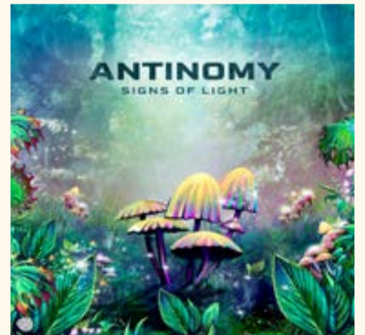
SIGNS OF LIFE BY ANTINOMY @IBOGA RECORDS