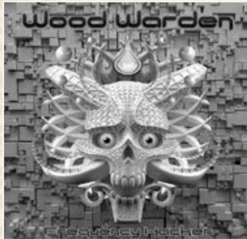
FREQUENCY HACKER BY WOOD WARDEN @WORLD PEOPLE PROD