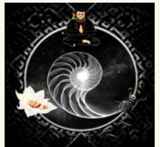
ESFERA BY NECROPSYCHO @TWENTY-FIVE RECORDS

RADIOZORA GOING GOA! HILLTOP APRIL 10, '22