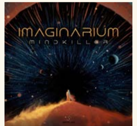
MINDKILLER BY IMAGINARIUM @DIGITAL OM