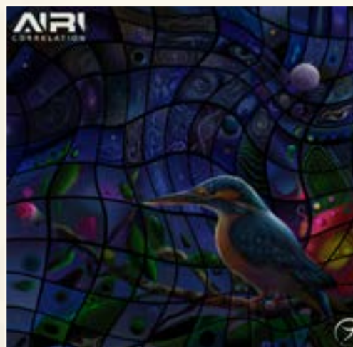
CORRELATION (16 BIT) BY AIRI @ZENON RECORDS