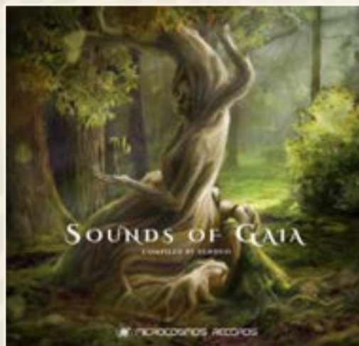
V.A. SOUNDS OF GAIA BY SUNDUO @MICROCOSMOS RECORDS