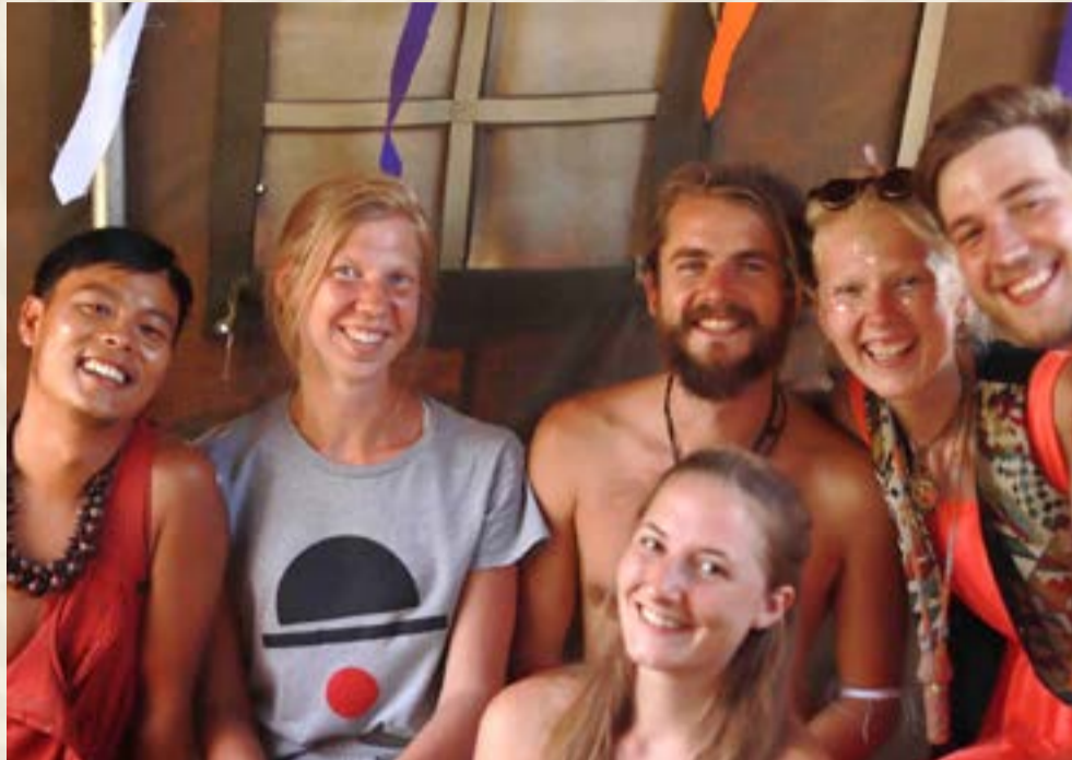
LAST WHEEL OF WISDOM INITIATES IN 2019

"I AM DIVIDING THE DISCUSSION OF THE CYCLE OF LIFE INTO FOUR DIFFERENT ESSAYS, EACH ONE COVERING A DISTINCT, CONSECUTIVE ELEMENT OF THE CYCLE. I HOPE THIS INFORMATION AND WAY OF PRESENTING THE MATERIAL DOES INVITES READERS TO REFLECT ON THEMSELVES, HOW THEIR EXPERIENCES SHAPED THEM, AFFECTED THEM."